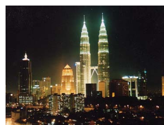
Petronas Twin Towers, Malaysia