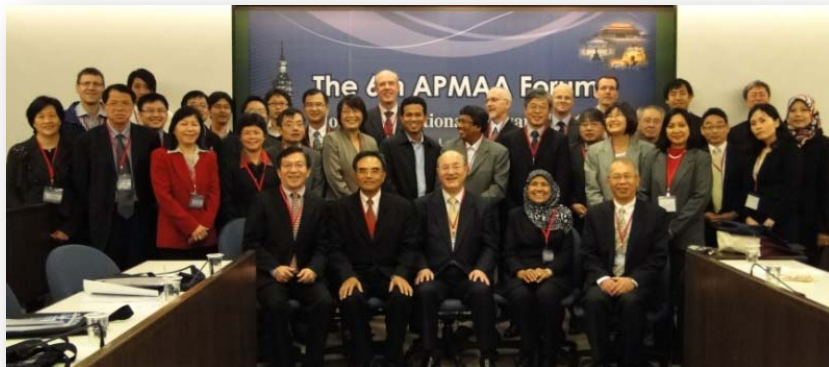
Presenters at the APMAA 6 th Forum, 5 th November, 2010